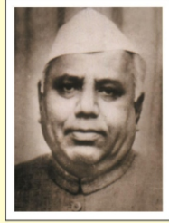
Late Shri. Yashwantrao Chavan Founder President (Ex Deputy Prime Minister)